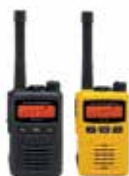
EVX-S24 COMPACT, DISCREET, LIGHTWEIGHT