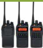
VX-450 SERIES BUILT TO LAST